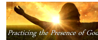
Practicing the Presence of God

Wherever God is, life is nurtured. Wherever God is, we are given space for living, finding renewal in the presence of the Holy in our midst. Where, and how, do you find yourself "at home" in God's presence, as an individual and as a church? Where, and how, do you invite others to come home to God?